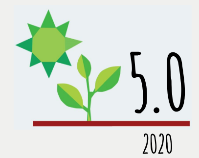
Total scores 2020 5.0 Average 5.0

Judgement scale: 1=poor, 2=moderate, 3=average, 4=good, 5=excellent